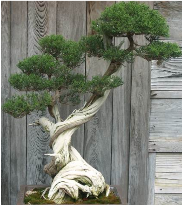
Figure 1: The Existential Trinity is the “organic” trunk; the first triunity is an “associative aggregate” shown by the weaving of the branches.

The existential trinity (the Paradise Trinity) consists of the Universal Father, the Eternal Son, and the Infinite Spirit. We are told in somewhat metaphorical terms that it is “corporative.” It is undivided and indivisible Deity; it is organic (1147:7; 104:3.8). Yet the same three existential Deities, as persons, functionally associate in a group called the first triunity. A good metaphor for a triunity is three people pulling on a rope in a tug-of-